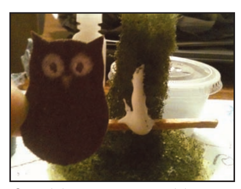
Cut owl shape out of paper and decorate with markers. Glue owl and stick to Foliage Fiber.