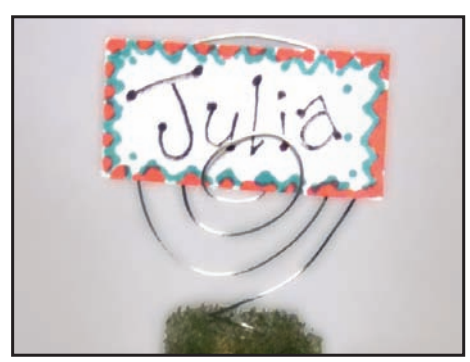
Insert photos or name placeholders into the wire spiral.