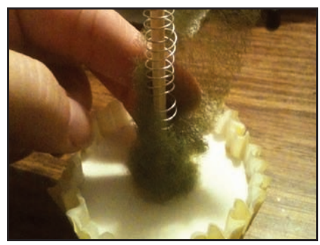
Cover stick and wire with Foliage Fiber.